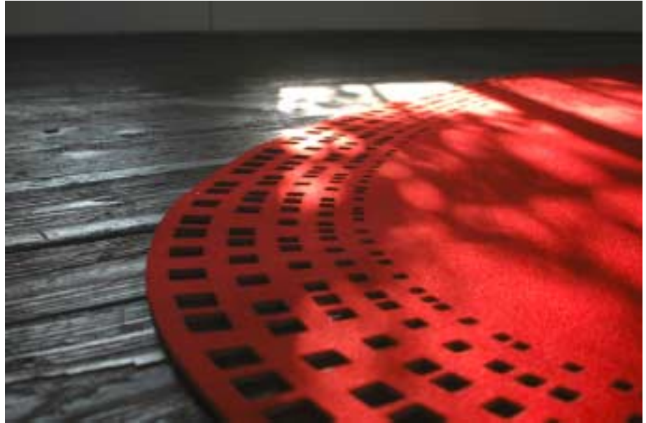
SALIM felt carpet in red, 160 x 325 cm