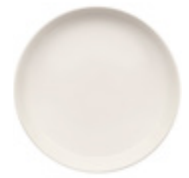
Plate deep 20,5cm - white