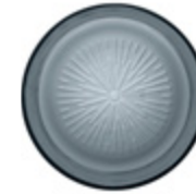
Bowl* 0,69 L - dark grey