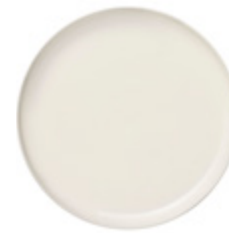
Plate 27 cm - white