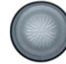
Bowl* 0,37 L - dark grey