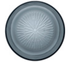
Plate* 21 cm - dark grey