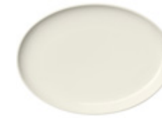
Plate oval 27,5 cm - white