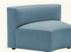
SF2379 Curved modular sofa with upholstered seat and backrest. Closed curved version.