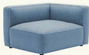
SF2375 Corner sofa (left side) with upholstered seat and backrest. Wide version.