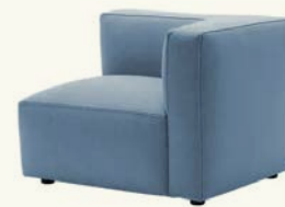
SF2380 Modular corner sofa with upholstered seat and backrest. Left side corner.