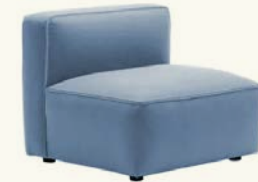
SF2371 Sofa with upholstered seat and backrest.