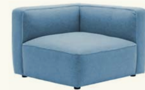
SF2373 Corner sofa (left side) with upholstered seat and backrest.