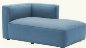
SF2376 Corner sofa (left side) with upholstered seat and backrest. Wide version.