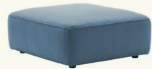
RS2383 Upholstered ottoman. Wide version.