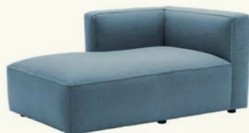
SF2377 Corner sofa (right side) with upholstered seat and backrest. Wide version.