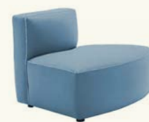
SF2378 Curved modular sofa with upholstered seat and backrest. Open curved version.