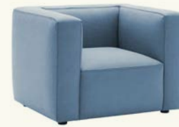
BU2370 Armchair with upholstered seat and backrest.

The Dado Outdoor modular sofa redefines versatility with its exceptional modular concept. This sofa adapts to any outdoor space, offering unlimited and flexible compositions. From seats to corner modules and chaise longues, each piece combines perfectly to create unique configurations. With options such as curved modules and ottomans, this sofa guarantees order and style. The auxiliary cushions complement the collection, providing additional comfort in different sizes.