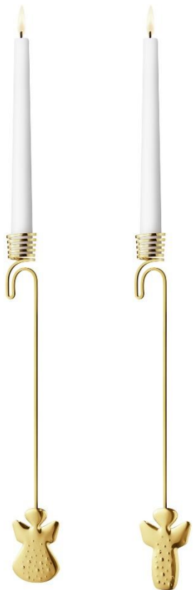
10007291 2017 CANDLE HOLDER, MICHAEL & RAPHAEL GOLD PLATED ZINC ALLOY

DKK 279 | EUR 40 | GBP 33 NOK 359 | SEK 349 | USD 55