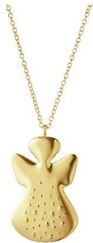
10002885 2017 ORNAMENT, RAPHAEL GOLD PLATED ZINC ALLOY H: 50 MM, W: 32 MM

DKK 279 | EUR 40 | GBP 33 NOK 359 | SEK 349 | USD 55