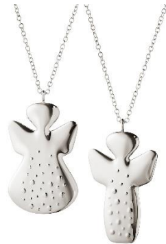
10007900 2017 ORNAMENT, MICHAEL & RAPHAEL PALADIUM PLATED ZINC ALLOY

DKK 129 | EUR 17 | GBP 15 NOK 169 | SEK 169 | USD 25