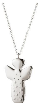
10002888 2017 ORNAMENT, MICHAEL PALLADIUM PLATED ZINC ALLOY H: 50 MM, W: 17 MM