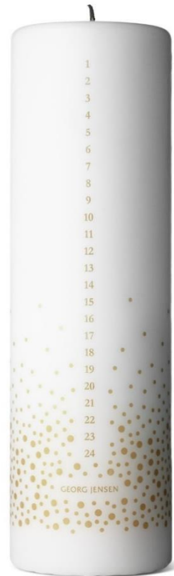
10002905 2017 CALENDAR CANDLE, GOLD PARAFIN H: 200 MM, Ø: 60 MM

DKK 279 | EUR 40 | GBP 33 NOK 359 | SEK 349 | USD 55