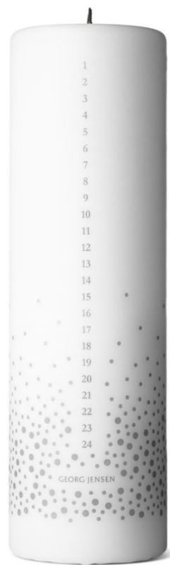
10002906 2017 CALENDAR CANDLE, PALADIUM PARAFIN H: 200 MM, Ø: 60 MM

DKK 129 | EUR 17 | GBP 15 NOK 170 | SEK 169 | USD 20