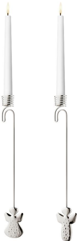
10007292 2017 CANDLE HOLDER, MICHAEL & RAPHAEL PALLADIUM PLATED ZINC ALLOY

DKK 279 | EUR 40 | GBP 33 NOK 359 | SEK 349 | USD 55