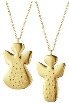
10007898 2017 ORNAMENT, MICHAEL & RAPHAEL GOLD PLATED ZINC ALLOY

DKK 129 | EUR 17 | GBP 15 NOK 169 | SEK 169 | USD 25