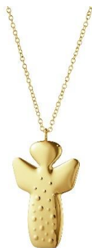
10002887 2017 ORNAMENT, MICHAEL GOLD PLATED ZINC ALLOY H: 50 MM, W: 17 MM

DKK 129 | EUR 17 | GBP 15 NOK 169 | SEK 169 | USD 25