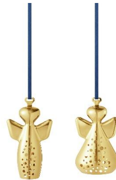
10007293 2017 HOLIDAY ORNAMENT, MICHAEL & RAPHAEL GOLD PLATED BRASS CLASSIC RED RIBBON INCLUDED

DKK 219 | EUR 29 | GBP 27 NOK 299 | SEK 289 | USD 40