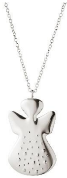
10002886 2017 ORNAMENT, RAPHAEL PALADIUM PLATED ZINC ALLOY H: 50 MM, W: 32 MM

DKK 129 | EUR 17 | GBP 15 NOK 169 | SEK 169 | USD 25