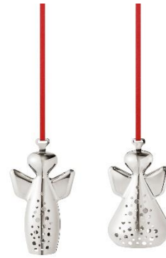
10007294 2017 HOLIDAY ORNAMENT, MICHAEL & RAPHAEL PALLADIUM PLATED BRASS BLUE RIBBON INCLUDED